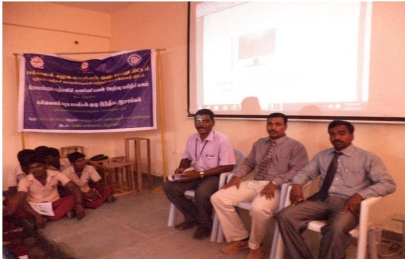
ONE DAY WORKSHOP ON "COMPUTER LITERACY" IN RURAL AREA UNDER UGC - 12 th PLAN