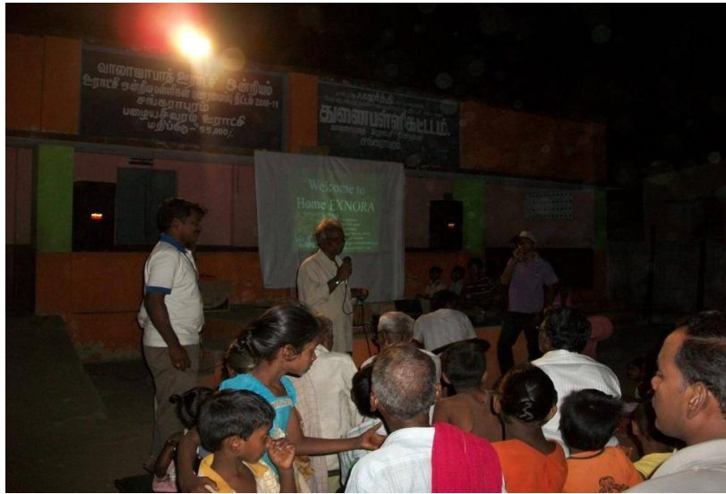
PROGRAMME OFFICER WITH SCHOOL CHILDREN