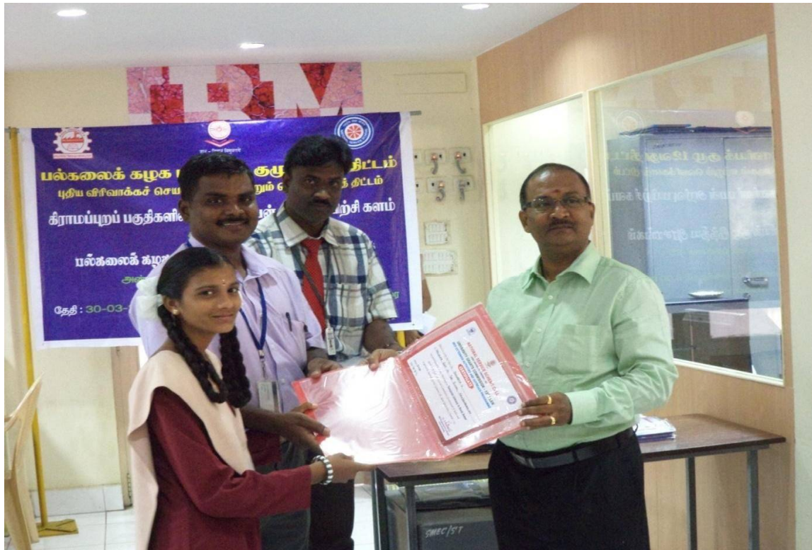
ONE DAY WORKSHOP ON "COMPUTER LITERACY" IN RURAL AREA UNDER UGC - 12 th PLAN