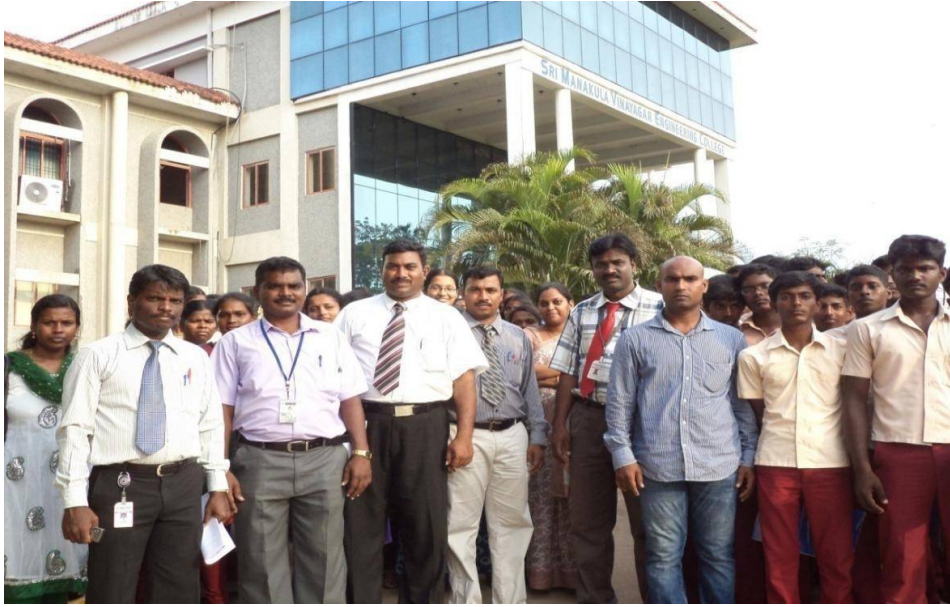
ONE DAY WORKSHOP ON "COMPUTER LITERACY" IN RURAL AREA UNDER UGC - 12 th PLAN