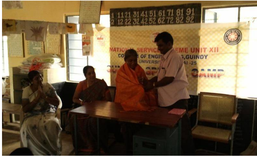
A TALK ON ENVIRONMENTAL ISSUES TO VILLAGE PEOPLE