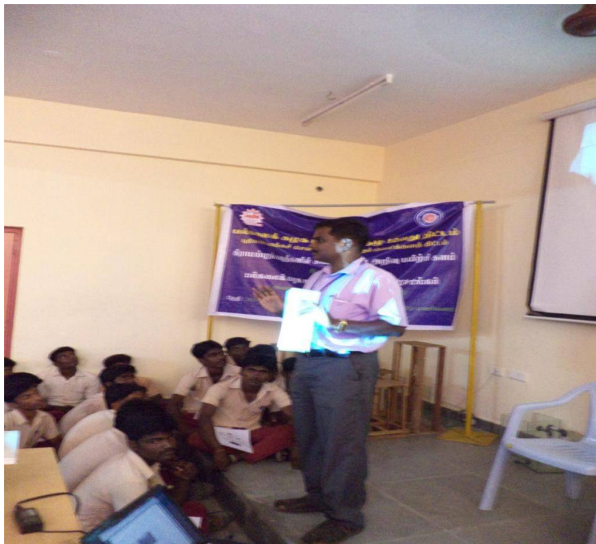
ONE DAY WORKSHOP ON "COMPUTER LITERACY" IN RURAL AREA UNDER UGC - 12 th PLAN